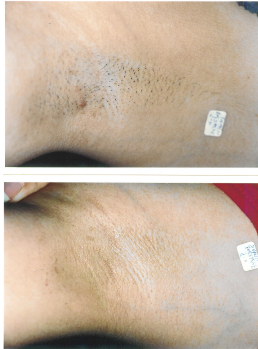
Figure 2 shows typical Silk'n Hair removal results in the Axilla, demonstrating dramatic reduction of 90% in hair count.

There were no complications in the study. Twenty-five percent (25%) of the study patients had peri-follicular erythema that resolved after one hour.