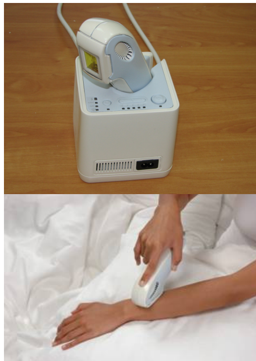
Figure 1. Silk'n Home Pulsed Light Hair Removal Device

Following the 10 th -11 th session patients were followed up after additional 3 months and standardized, close up photography was performed. All photographs were then submitted to a dermatologist observer, experienced in laser hair removal treatments, who calculated the hair density for each of the two regions, treated and untreated in each photograph. The observer was blinded to which zone in each photograph had been treated with the Silk'n device.