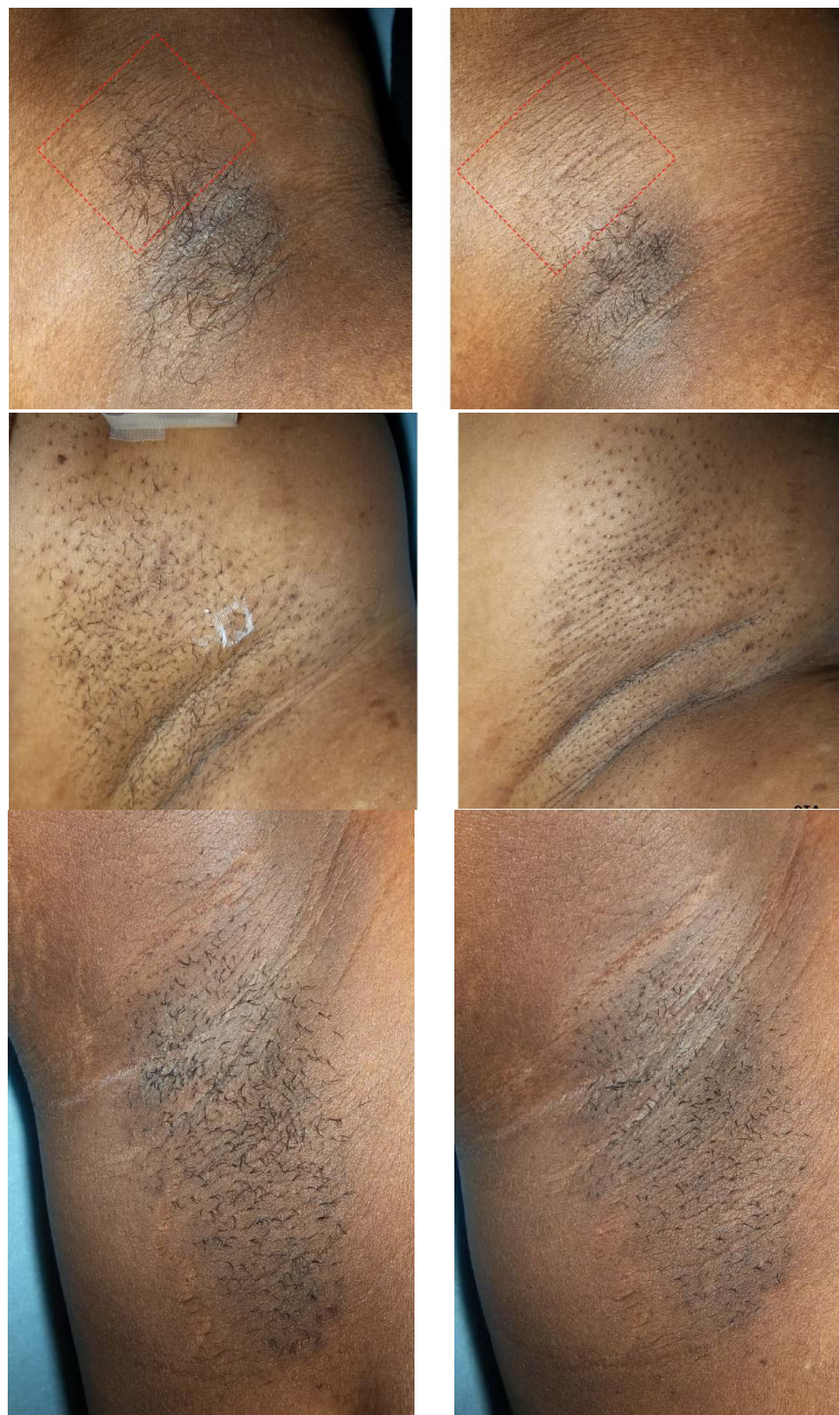
Figure 4. Photographic illustration of hair reduction in axillae of 3 subjects at baseline (Left) and 3 months post last treatment (Right). Top to bottom: subjects 3R, 10R, and 11R.

areas after 3 months following 3 treatments was 64%. The three studies were conducted on light skin types, up to Fitzpatrick skin type IV.