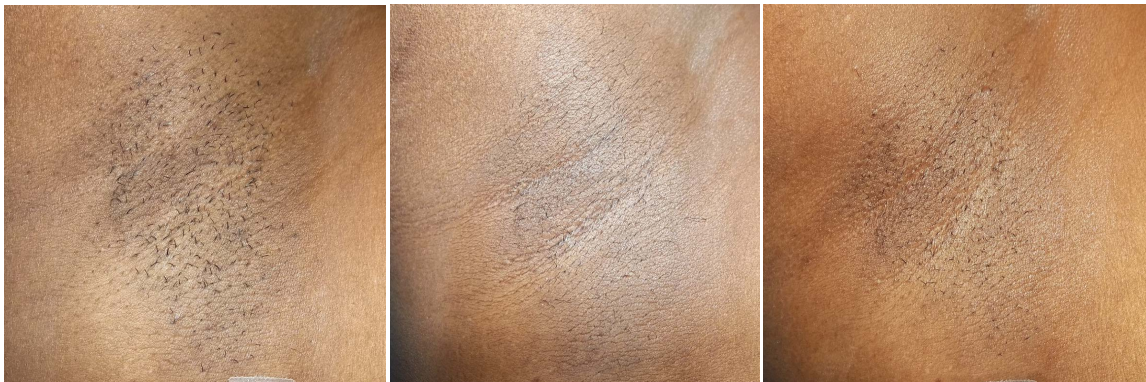
Figure 3. Photographic illustration of hair reduction in axillae of subject 1 at baseline (left), at 1 month follow-up session (center), and 3 months post last treatment (right).

photographs indicate that percent hair reduction after 3 month is smaller than after 1 month.