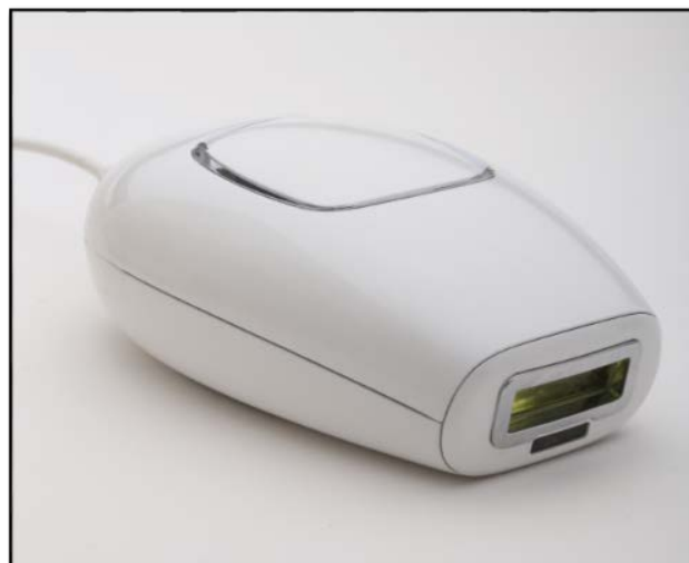
Figure 1. The Infinity Device.

Inclusion criteria included healthy females between 21 - 60 years of age with skin type VI, having unwanted