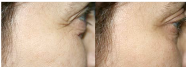
Figure 5. Female periorbital wrinkling (crow's feet) before (left) and after 3 months.