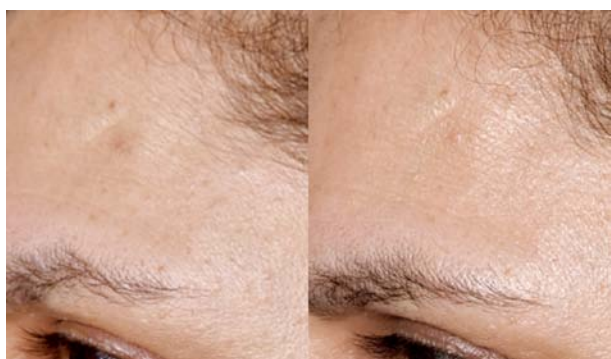
Figure 12. Forehead pigmentation before (left) and after 1 month.

Most patients expressed their degree of satisfaction to the overall improvement of facial skin after 1, 2, and 3 month follow-up sessions, as described in Table 2 . Patients related to skin texture (pores, elasticity and firmness), to fine line and wrinkles and to pigmentation. No one experienced lack of response. Most patients (88% - 91%) reported considerable and some response at all 3 points of follow-up.