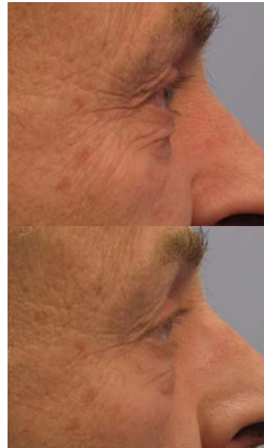
Figure 6. Male periorbital wrinkling (crow's feet) before (left) and after 3 months.