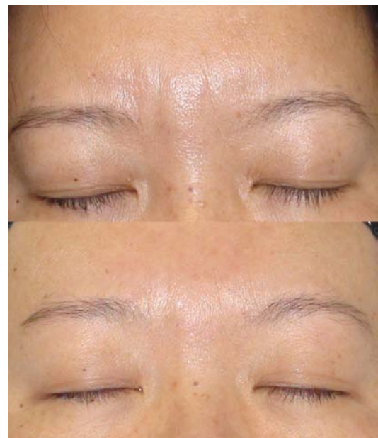
Figure 8. Forehead wrinkling before (top) and after 2 months (bottom).