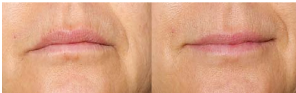
Figure 3. Upper lip smoker lines before (left) and after 1 month (right).

Results evaluated by a blind independent physician are summarized in Table 1. The results show that as time elapses, there is a gradual improvement in all lesions. At 3 months follow-up, 94% and 98% of patients were evaluated as having excellent or considerable improvement in wrinkling and skin texture, respectively. Improvement of pigmentation was less apparent and was recorded after 3 months as 45% of patients having excellent or considerable improvement. There were no non-responders, and 5% of patients showed poor results only for pigmentation.