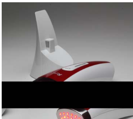
Figure 1. Silk'n Reju/FaceFX facial skin rejuvenation device and charging cradle.

Patients were guided how to use the equipment and treated themselves under the guidance of a qualified person in the study sites clinics. Facial treatment zones were