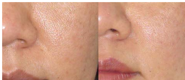
Figure 10. Large pores before (left) and after 2 months.